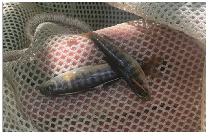
Figure 1.–Juvenile coho salmon caught at waypoint 1110.