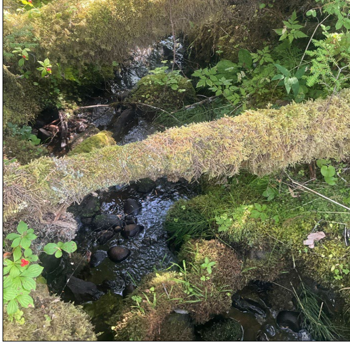
Figure 2.—Looking upstream at waypoint 1112.