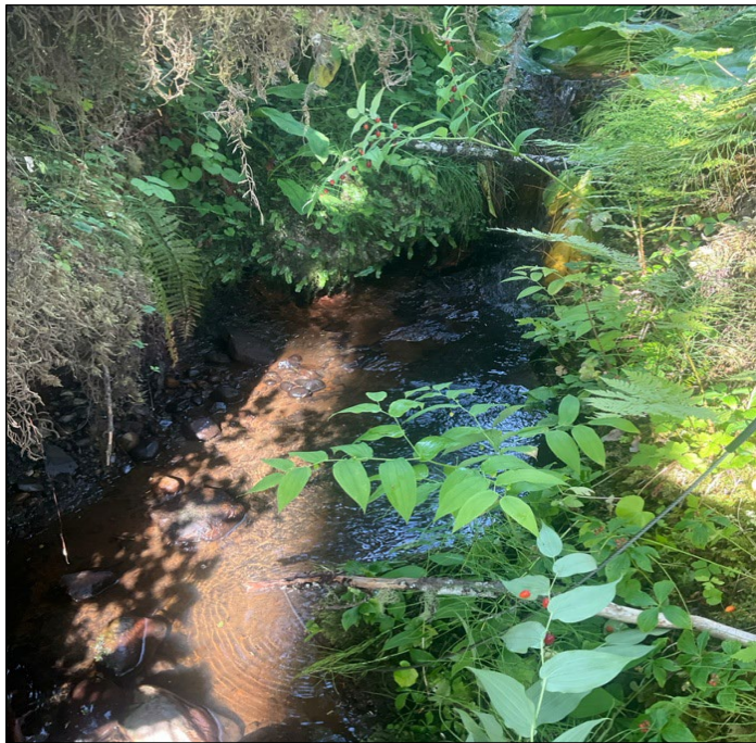
Figure 3.—Looking downstream at waypoint 1112.